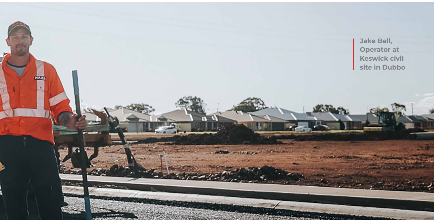
Jake Bell, Operator at Keswick civil site in Dubbo

important tool in helping identify wrongdoing that may not otherwise be uncovered. Our policy is designed to encourage people to speak up when they become aware of potential wrongdoing; ensure disclosure is safe, secure, protected and supported; ensure disclosures of potential wrongdoing are dealt with appropriately and on a timely basis; provide transparency around our disclosure framework; explain available protections to whistleblowers; deter wrongdoing in line with our risk management and governance framework; and support our values and Code of Conduct.